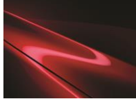
Soul Red Crystal

The Mazda3 will be available in the below exterior colour choices.